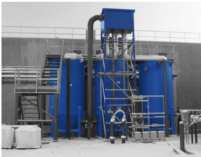
0.75 MGD (33 L/s) Centra-flo™ installation in New York

With over twenty years of international installation history and experience, Centra-flo™ filters have established a reputation in the wastewater industry for providing effective solutions to municipal and industrial clients alike.